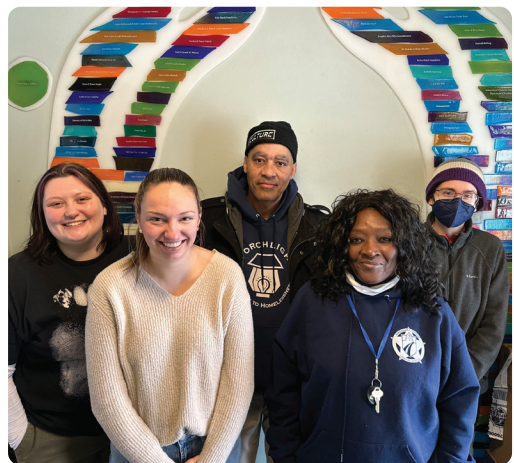
Pictured is our amazing Safe Haven staff! We are so thankful for their dedication to our clients and mission.